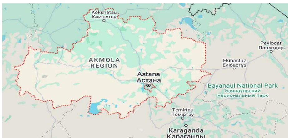
Fig. 1. Akmola region location.

meteorological station located in the Akmola region, which is the closest meteorological station to the study area, the average annual temperature is 17 °C, the average annual rainfall is 1300 mm, and the dry season is from June to August (based on the ten-year period 2010-2020). The soil texture is loam-silty-sandy.