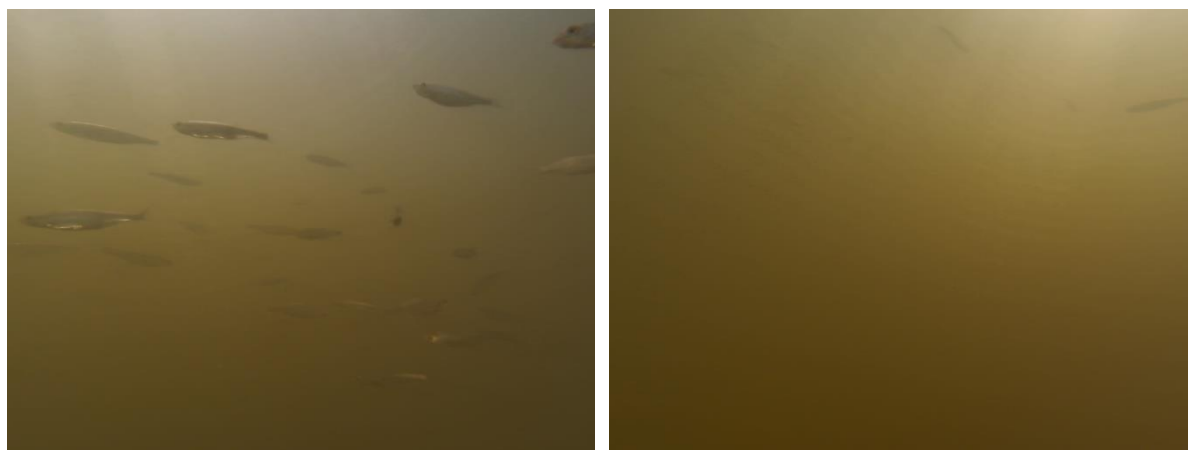
Fig. 2. Fish behaviour before turning on (left); the underwater acoustic speaker, and after turning it on (right).

Table 2 shows the data on the efficiency of fish frightening under acoustic exposure in the range from 55 to 95 dB, in conditions of attraction. From the analysis of Table 2, it follows that sounds with a loudness of 95 dB are most effective in scaring away fish. High deterrence efficiency is maintained at a distance of up to 3 m. A sound with a loudness of 85 dB significantly affects fish at a distance of no more than 1 m.