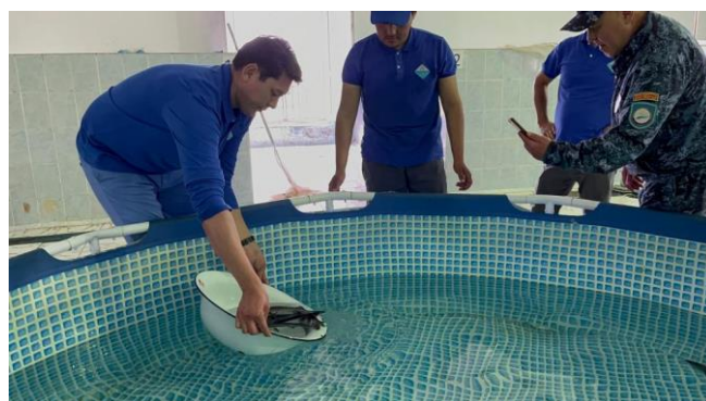
Fig. 11. Release of juvenile bastard sturgeon into the basin of the Kapshagai HPP.