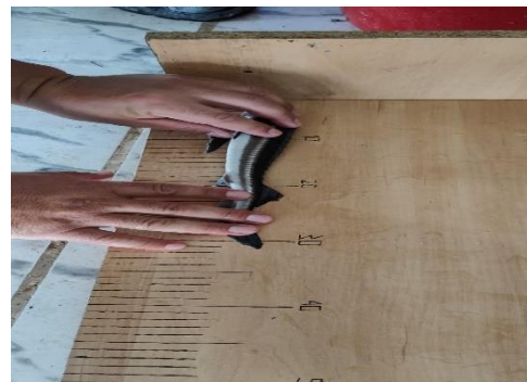
Fig. 10. Juvenile bastard sturgeon from the Kapshagai Reservoir (96 km), June 2022.