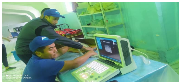
Fig. 7. Determination of the bastard sturgeon sex using an ultrasound machine.