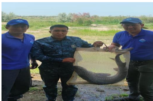
Fig. 5. Bastard sturgeon from Kapshagai reservoir, caught according to the Permit issued for research purposes.