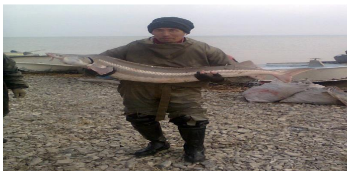
Fig. 4. Photo of a bastard sturgeon more than 1 m long, weighing 12 kg, caught in Kapshagai reservoir (area 96 km) in 2015.

In the area of "Salt Lakes", the upper reaches of the reservoir – fishermen in April of this year when clearing the bed of the fishing area (No. 24), they pulled out an abandoned Chinese net, i.e., a veined cobweb, in which, along with other species, about 10 kg of a rotten and half-decomposed bastard sturgeon were found. According to the surveys of fishermen and amateurs, as well as local residents, it was found that in Kapshagai reservoir (right bank) and Ili River in the area of Ayak-Kalkan, Dubuni, Onopko and others, poachers periodically caught immature individuals of the bastard sturgeon. After lengthy negotiations, photos of bastard sturgeon were obtained (Fig. 4).