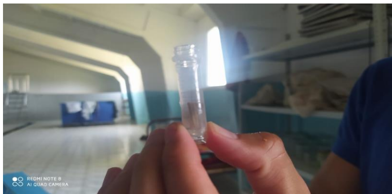
Fig. 8. Selected sample of the biological material of bastard sturgeon for genetic research.