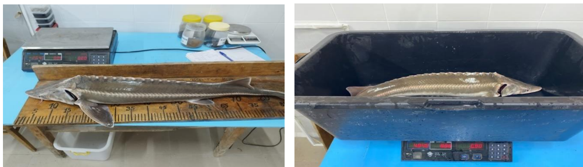
Fig. 12. Bastard sturgeons caught in the lower reaches of the Ili River.

juveniles from reproduction, as well as the constant pressure on them of the widely used net fishing in the reservoir, does not make it possible to increase its numbers.