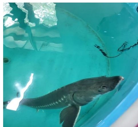
Fig. 9. Bastard sturgeon in the RAS basin of the Balkhash fish-breeding area of "RPCF" LLP.