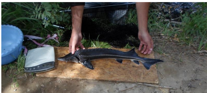
Fig. 2. Photo of a bastard sturgeon 50 cm long, weighing 1.2 kg caught in Ili River (2015).

It is quite possible that timely measures taken to introduce a fishing regime conducive to the conservation of juveniles would have made it possible to create a fairly large self-reproducing herd of bastard sturgeon in Lake Balkhash. The effectiveness of such measures was proved by the example of the restoration of the number of sturgeons in the Caspian Sea after the introduction in 1965 of a ban on marine net fishing. Along with this, significant damage to the reproduction of bastard sturgeon in Lake Balkhash was also caused by the construction of the Kapshagai hydroelectric complex, which blocked the path of bastard sturgeon to the main places of its reproduction. In 1987, the number of bastard sturgeon decreased significantly, which was primarily due to a sharp deterioration in the conditions for the development of juveniles and a reduction in the area of spawning grounds (Primak 2002). In 1991, the Aral population was included in the Red Book of Kazakhstan. In 2002, the Balkhash-Alakol population of bastard sturgeon was included in the list of protected species. According to our field sampling in the seasons of 2015, 2 bastard sturgeons were found. The first copy was caught in Ili River at 126 km in June. Its length was 50 cm and weight 1.2 kg (Fig. 2).