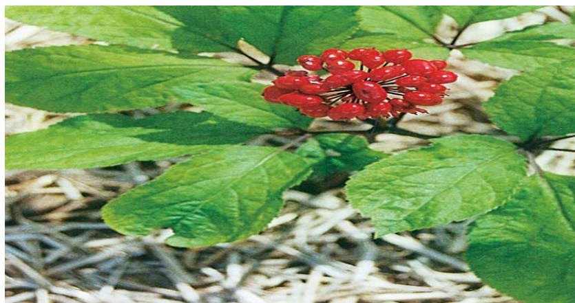
Panax ginseng plant.

P. ginseng contains many active substances. The substances thought to be most important are called ginsenosides or panaxosides. Ginsenosides is the term coined by Asian researchers, and the term panaxosides was chosen by early Russian researchers. P. ginseng is often referred to as a general well-being medication, because it affects many different systems of the body.