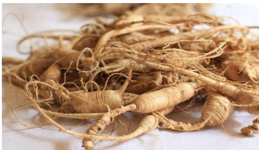
Panax ginseng root.