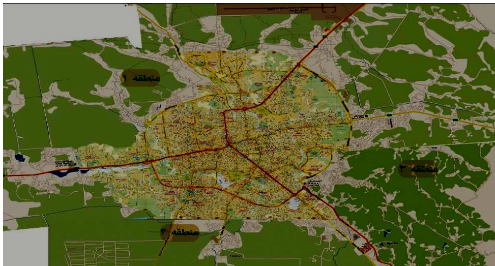
Fig. 1. Various regions limits considered for waste collecting by Rasht municipality (Guilan Science & Technical Park, 2010a).

Saravan waste latex enters Anzali Wetland through Zarjoub and Pirbazar Rivers (Guilan Science & Technical Park, 2010b).