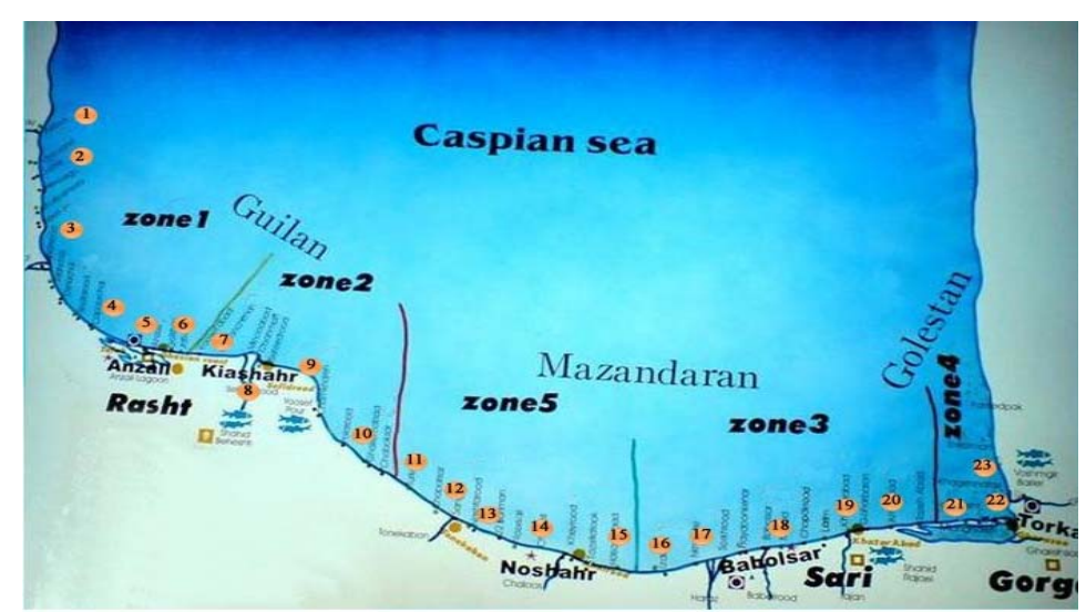
Fig. 1. The locations of the Persian sturgeon sampling sites. Sampling localities (1-23) from south Caspian Sea along the Iranian coast (Fisheries Zone 1-5).

All the sampled individuals were mature and in spawning condition. The location of