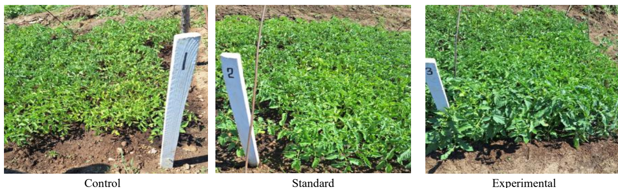
Fig. 3. Visual appearance of tomato seedlings under different treatments: control; chemical standard; experimental (biological) treatment (field experiment, 2025).