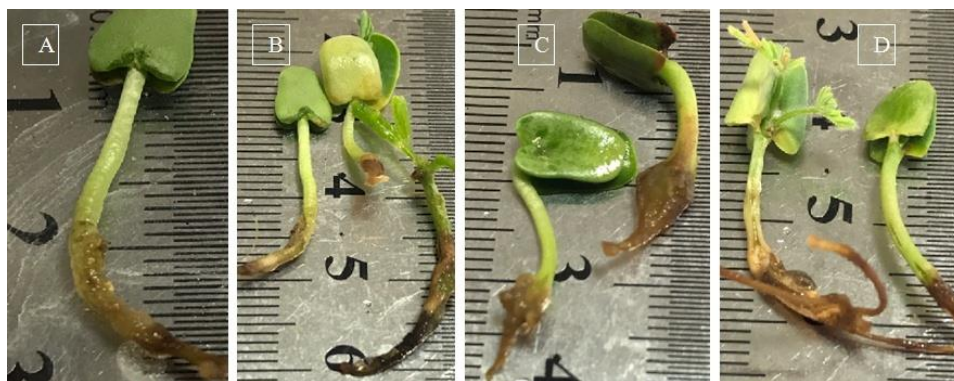
Fig. 5. Growing of Acacia tortilis seedlings after 2 months in T 1 (A), T 5 (B), T 8 (C) and T 10 (D).

Typically, seedlings with high root volume are preferred to seedlings with well-developed aerial parts and weak roots, because it will have a higher performance both in better establishment in natural conditions and in absorbing more water and food (Hasanuzzaman et al. 2020). In this study, T 8 has the highest value of the aerial to ground ratio (1.35), exhibiting low root growth, and the relatively ideal value of the intended characteristic belongs to T 2 (0.62). Numerous factors are involved in the production of root type and volume, including the type of culture medium, nutrients, types of hormones used in the culture medium, etc. It is worth mentioning that the use of suitable seedlings for different areas with different ecological conditions is a very important issue that by knowing this point, the desired seedlings can be produced (Hasanuzzaman et al. 2020).