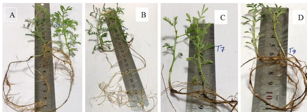
Fig. 4. Growing of Acacia tortilis seedlings after 2 months in T 2 (A), T 4 (B), T 7 (C) and T 9 (D).