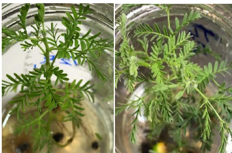
Fig. 3. Seedlings of Acacia tortilis Under in vitro condition in T 2 (A) and T 4 (B).