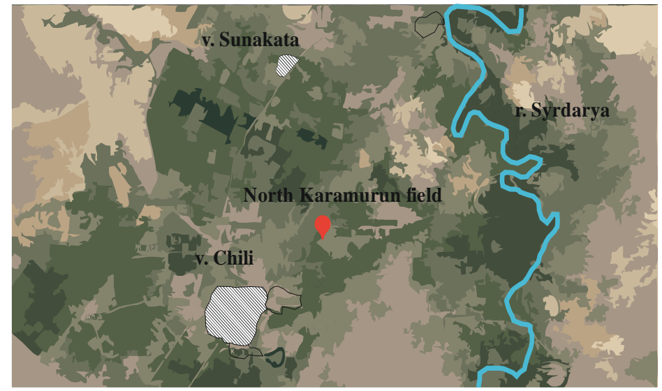
Fig. 1. Syrdarya Uranium Ore Province, Northern Karamurun deposit.

uranium mining enterprises. From the general population of the uranium ore province of Syrdarya, according to medical records, individuals of both sexes over the age of 18 with a confirmed diagnosis of diseases of the urinary system were selected. 758 people were examined in Bidaykol village, 297 in Sunakata and 649 in Shardara.