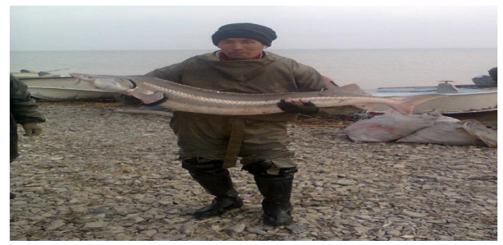
Fig. 4. Photo of a bastard sturgeon more than 1 m long, weighing 12 kg, caught in Kapshagai reservoir (area 96 km) in 2015.

In the area of "Salt Lakes", the upper reaches of the reservoir – fishermen in April of this year when clearing the bed of the fishing area (No. 24), they pulled out an abandoned Chinese net, i.e., a veined cobweb, in which, along with other species, about 10 kg of a rotten and half-decomposed bastard sturgeon were found. According to the surveys of fishermen and amateurs, as well as local residents, it was found that in Kapshagai reservoir (right bank) and Ili River in the area of Ayak-Kalkan, Dubuni, Onopko and others, poachers periodically caught immature individuals of the bastard sturgeon. After lengthy negotiations, photos of bastard sturgeon were obtained (Fig. 4).