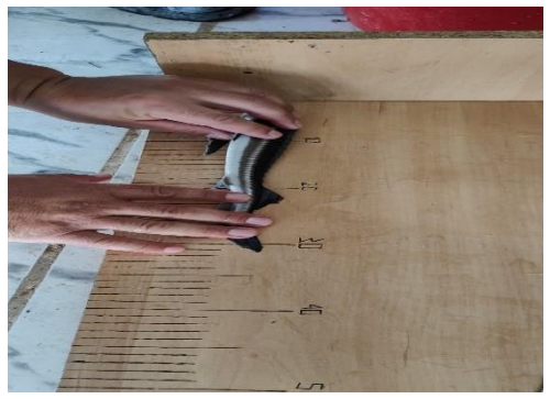
\textbf{Fig. 10.}\ \ \text{Juvenile bastard sturgeon from the Kapshagai Reservoir (96 km), June\ 2022.}