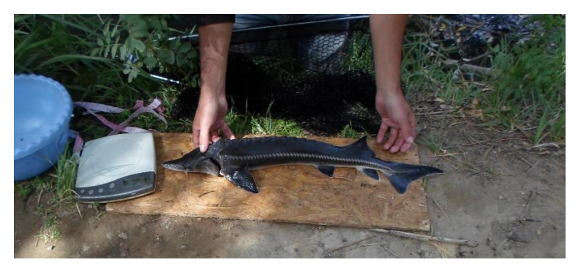
Fig. 2. Photo of a bastard sturgeon 50 cm long, weighing 1.2 kg caught in Ili River (2015).

It is quite possible that timely measures taken to introduce a fishing regime conducive to the conservation of juveniles would have made it possible to create a fairly large self-reproducing herd of bastard sturgeon in Lake Balkhash. The effectiveness of such measures was proved by the example of the restoration of the number of sturgeons in the Caspian Sea after the introduction in 1965 of a ban on marine net fishing. Along with this, significant damage to the reproduction of bastard sturgeon in Lake Balkhash was also caused by the construction of the Kapshagai hydroelectric complex, which blocked the path of bastard sturgeon to the main places of its reproduction. In 1987, the number of bastard sturgeon decreased significantly, which was primarily due to a sharp deterioration in the conditions for the development of juveniles and a reduction in the area of spawning grounds (Primak 2002). In 1991, the Aral population was included in the Red Book of Kazakhstan. In 2002, the Balkash-Alakol population of bastard sturgeon was included in the list of protected species. According to our field sampling in the seasons of 2015, 2 bastard sturgeons were found. The first copy was caught in Ili River at 126 km in June. Its length was 50 cm and weight 1.2 kg (Fig. 2).