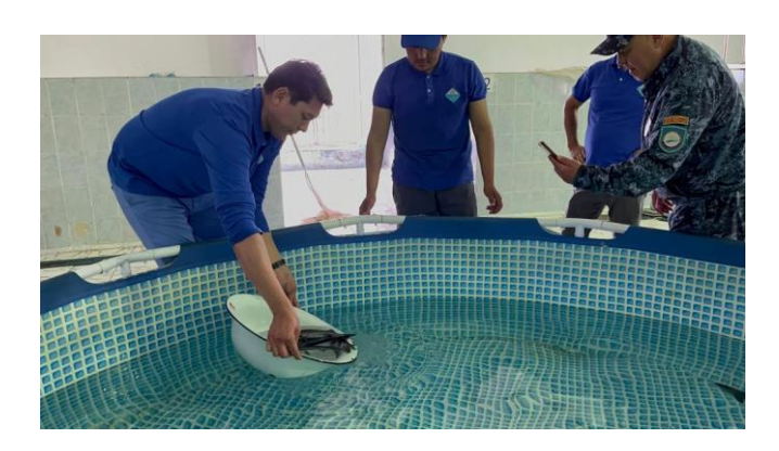
Fig. 11. Release of juvenile bastard sturgeon into the basin of the Kapshagai HPP.