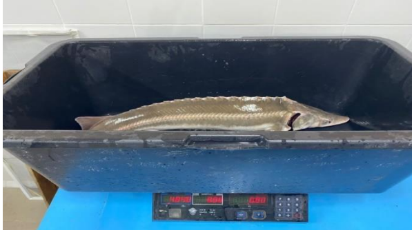
Fig. 12. Bastard sturgeons caught in the lower reaches of the Ili River.

Thus, the conducted studies have shown the fundamental possibility of wild thorn domestication in industrial conditions. In scientific and commercial catches, only sturgeon juveniles occasionally come across. One of the main ways to preserve the "Red Book" species is the artificial reproduction and stocking of water bodies. Thus, in Kapshagai reservoir and Ili River (upper course), to restore the population of the bastard sturgeon, it is necessary to artificially reproduce it and create conditions under which the mortality of juveniles in the nets reduces. However, given the low probability of capturing sexually mature specimens of bastard sturgeon in this reservoir, it is not possible to obtain mass offspring from them artificially soon. We believe that the most likely and possible way out of this situation is to carry out activities for the purchase of spawners or fertilized bastard sturgeon eggs with further incubation in the conditions of domestic fish farms. For example, in neighboring countries, some fish farms are successfully engaged in artificial breeding of sturgeon, including the cultivation of sturgeon. The bred viable juveniles of bastard sturgeon will make it possible to create repair and broodstocks at the fish farms of the Aral-Syrdarya and Balkash-Alakol basins.