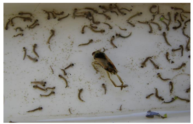
Fig. 1. Field experiments with Notonecta glauca.