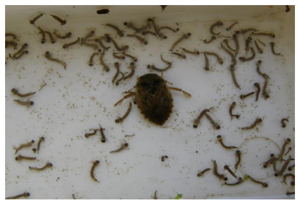
Fig. 2. Field experiments with Ilyocoris cimicoides .