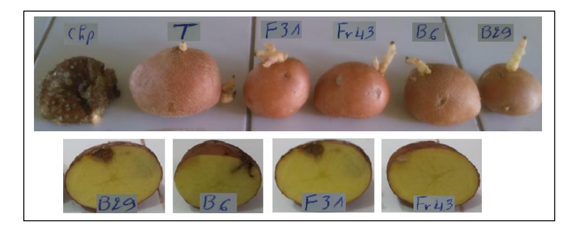
Fig. 3. The ability of bacteria to protect tubers against F. oxysporum under storage conditions. Ch: control treated with a fungal suspension of F. oxysporum , T: untreated control, F31 , Fr43 , B6 , B29 : Tubers treated with bacteria and the fungal suspension of F. oxysporum .

Fig. 3 illustrates the fact that the bacterial strains Fr43, F31, B6 and B29 are able to protect potato tubers against Fusarium oxysporum under storage conditions. This protection results in a complete reduction of the infection rate and the severity of the symptoms caused by F. oxysporum compared to the control.