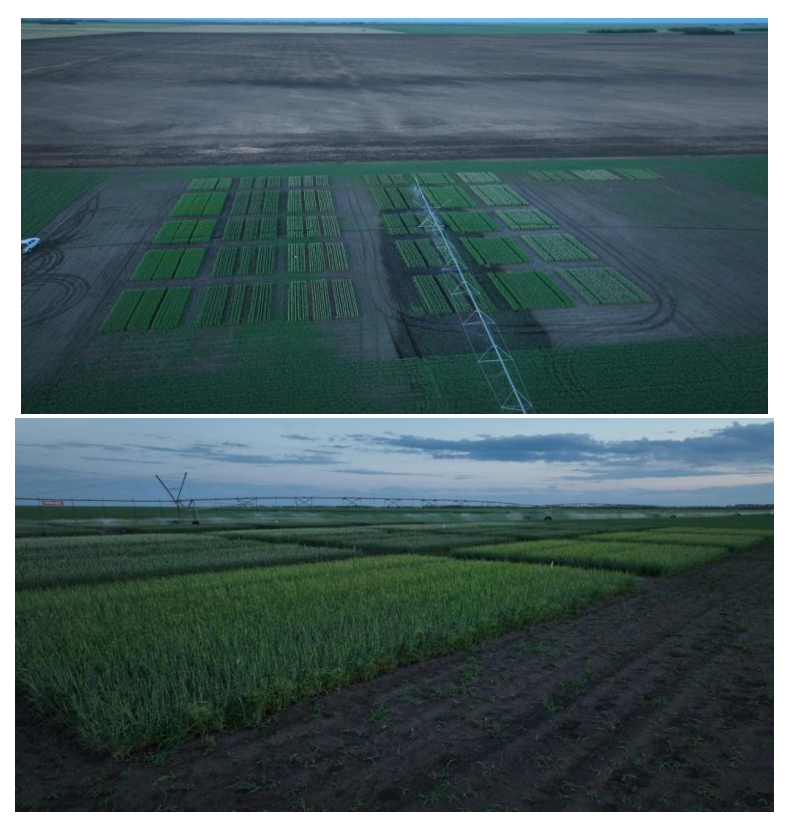
Fig. 3. Sprinkler irrigation system used at the experimental site.

The capillary use of groundwater in the area under consideration is minimal due to the large depth of their occurrence. In 2022, the shortage of water consumption was observed only in the second and third 10-day periods in May and the first 10-day period in June. There is a surplus of water consumption in the remaining months due to the large amount of precipitation. We planned to use a sprinkler irrigation system with a modern sprinkler machine for the irrigation of crops that provides fine sprinkling with low rain intensity and does not adversely affect the soil cover (Fig. 3).