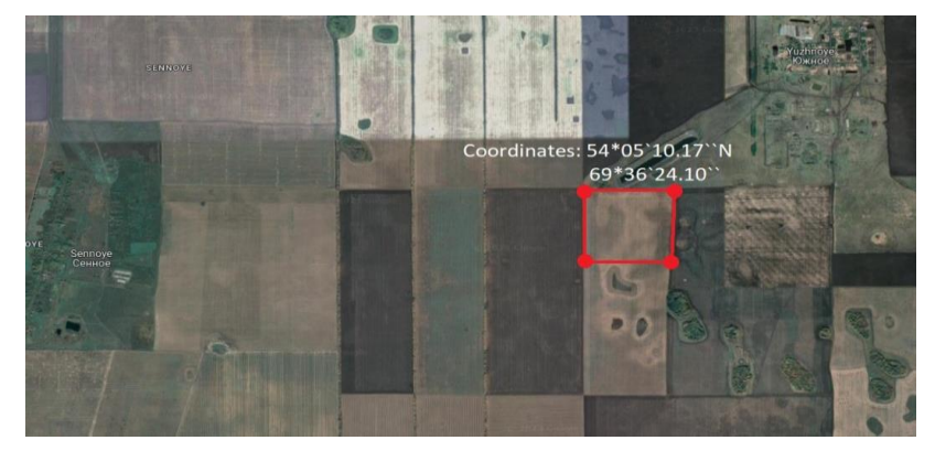
Fig. 1. Location of the experimental site.

Experimental studies were conducted at an experimental station located in the Akkay in District of the North Kazakhstan region (Fig. 1). The characteristics of the soils were as follows: ordinary carbonate, heavy, loamy, chernozem with neutral and slightly alkaline reactions.