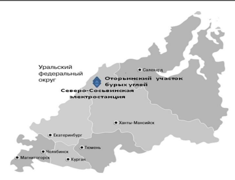
Fig. 1. Geographical location of the Otoryinskoye field deposit.