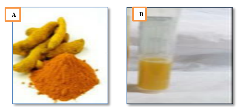
Figs. 3A: Tubers and turmeric powder; B: curcumin extract