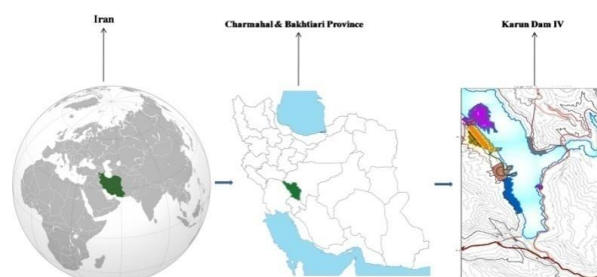
Fig. 1. The position of Karun Dam IV.

The tourism area of Karun Dam IV is located between longitude 50° 16' to 50° 46' and latitude 31° 35' to 35° 53'. It is located in the borderlines of Chaharmahal -va- Bakhtyari and Khuzestan provinces. There are 17 districts and 39 rural districts in the border limits of the Province. Lordgan and Ardal are among the townships located in the Province. The area of Karun Dam IV is located in the territory of Iranian Power and Water Resources Development Company.