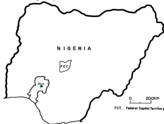
Fig. 1. Map of Nigeria showing the position of Akure. (Olanrewaju, 2009).

The study area is Akure (shown in figure 1), a medium-sized urban centre and the former provincial headquarters of Ondo province in 1939. In 1976, it became the capital city of Ondo State and a local government headquarters. The state has eighteen (18) local government areas with land areas of 13,595km 2 . Akure is located on Latitude 7° 15' North and Longitude 5° 15' East. The state lies within the sub-humid tropics (Olanrewaju 2009). Over the years, the population of Akure has been increasing tremendously since it started to enjoy the status of both state capital and local government headquarters. Since the rebirth of democracy in Nigeria in 1999, Akure has continued to witness tremendous increase in population as a result of rural-urban migration arising from the influx of many political office holders and their families as well as job seekers. While the 2005 census put the population of Akure at 324,000, the current population of the city is put at 495,000 people. By 2015, it is projected that Akure will be inhabited by about 1.8 million people (NPC, 2009).