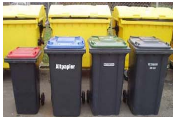
Fig. 3. Samples of waste bin distributed in Akure.

Table 3 shows the available waste collection vehicles for both state and local Government Waste Management Agencies.